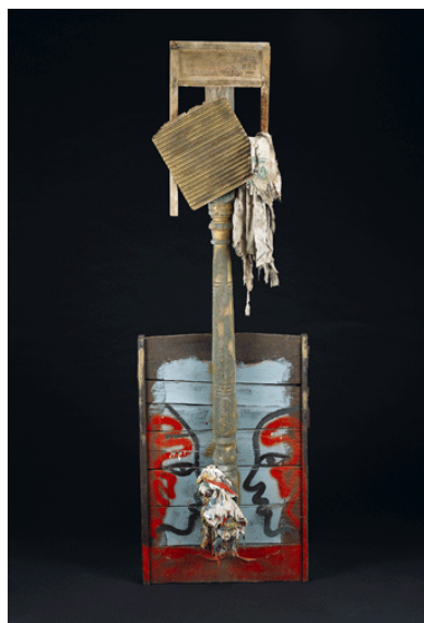
Lonnie Holley (b. 1950). The Gold at Grandmother's Post. 1988. Washboard, bedpost, quilt, wood, spray paint, house paint. 76 X 23 1/2 X 9 1/2 in.